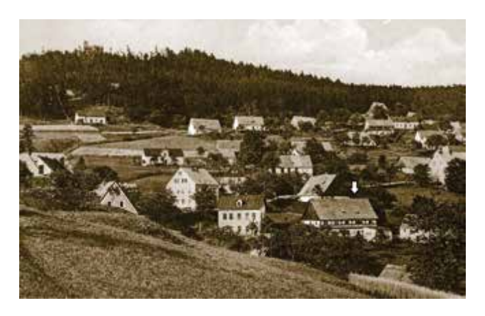
Figure 2. Birthplace of Ferdinand von Arlt in Obergraupen (Horní Krupka), early 20th century (arrow)

by Prince Johann von Clary und Aldringen (1753–1826) [1]. The school was in the centre of the village next to St. Valentine's Church. Today, on that site at the address Vrchoslavská 2/3, is a three-story residential building. He attended grammar school from 1825 in Leitmeritz (today Litoměřice) in Jesuitengasse, which was located next to the Episcopal Priestly Seminary (former Jesuit residence). In Litoměřice he had accommodation at the grammar school (alumnat) [2]. Today this is Jesuit Street no. 18 and 20, and the former seminary was at no. 22.