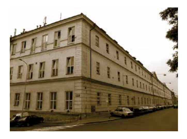
Figure 3. Eye Clinic was located on the second floor in the east wing of the general hospital in Prague (today U Nemocnice 2)

Von Arlt was the first to give an accurate description of trachoma (1855) and was the first to understand the essence of the pathogenesis of myopia (1854), arguing