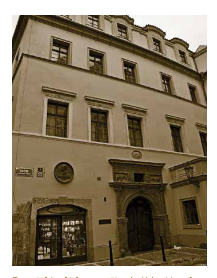
Figure 5. Schwefel Gasse no. 475, today Melantrichova Street no. 16

From 1844 to 1847, he lived in the centre of Prague (near the Old Town Square), at Schwefelgasse no. 475/I. Since 1894, it has been called Melantrichova Street (no. 16). Above the entrance are sculptures of two golden bears. That is why the house is called "House at the Two Golden Bears" (Dům u Dvou Zlatých Medvědů). It is a large Renaissance building, one of the oldest buildings in Prague, built in 1559–1567 on the site of two Gothic houses. The building was reconstructed in 1975–1980 [21–23] (Figure 5). In 1846, his teacher J. N. Fischer lived in Prague's New Town at Heinrichsgasse no. 889 on the ground floor (today Jindřišská 17) [24].