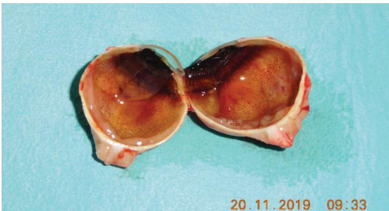
Figure 2. Bulbus after the enucleation: intraocular mass 2x1cm with circular overgrowing around the optic nerve

wall of the bulbus under the choroid was described as a solid infiltration of small lymphocytes, with a round or slightly folded nuclear membrane, lumpy chromatin, central nucleus, small amount of cytoplasm, with formation of germ / proliferative centres; mitotic activity was low. The same infiltration was in the retrobulbar tissue around the optic nerve.