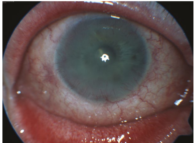
Fig. 5. Right eye of patient from case report 2 with mixed injection of conjunctiva, semitransparent cornea and peripheral limbal superficial and deep corneal vascularisation

A seventy two year old woman was sent to our centre by a local ophthalmologist due to bilateral keratitis upon a background of general pathology of rosacea, for which she had been receiving treatment since 2016. She stated deterioration of vision over the course of approx. 3 weeks, lachrymation and reddening of the eyes. BCVA in the right eye was 1.5/60, in the left eye 0.3/60. Actinic keratosis was visible on the face (Fig. 4). The following finding on the anterior segment was recorded bilaterally: conjunctiva with mixed injection, seropurulent secretion and follicular reaction, cor-