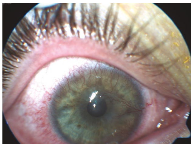
Fig. 2. Right eye of patient from case report 1, visible mixed corneal vascularisation