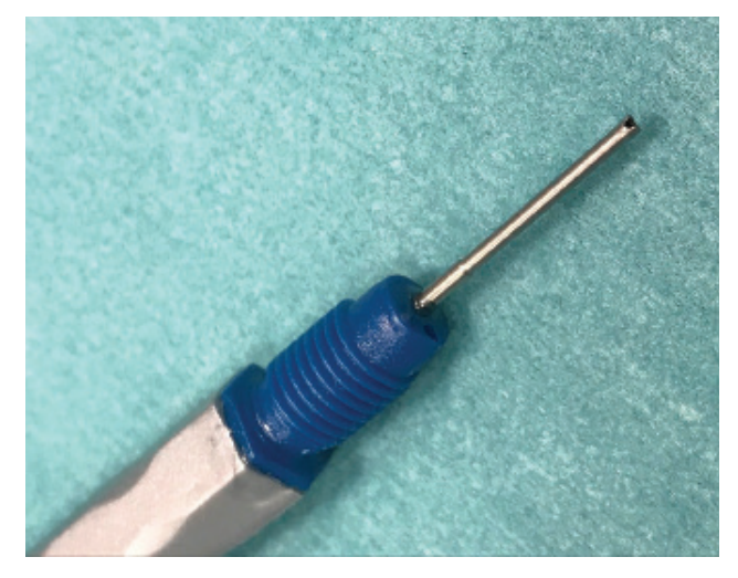
Fig. 2. Detail of end of nanosecond laser

0.98 \pm 0.04 . There was no statistically significant difference between the individual groups (p = 0.65).