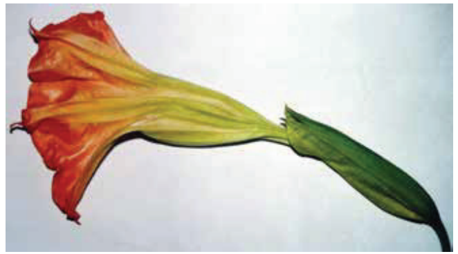
Fig. 2. Goblet-shaped flower of plant Datura suaveolens

in the left eye, there was also no constriction of the pupil. A test with 1.0 Pilocarpine differentiates a neurogenic cause of mydriasis from mydriasis caused by a cholinergic antagonist. If the muscarinic receptors on the affected side are occupied by an anti-cholinergic agent, 1% Pilocarpine leads to weak or no miosis. By contrast, in the case of neurogenic causes of mydriasis, clear constriction of the pupil takes place upon its application (2). In this case therefore the pharmacological test confirmed mydriasis induced by an anti-cholinergic agent. After a number of targeted questions (what was the child doing, where was it playing, with what did she come into contact, for example plants?) we determined contact with the plant Datura suaveolens , known as “Brazil's white angel's trumpet” (Fig. 2). The child broke off and held in her hand a goblet shaped flower of this plant. The medical history of contact with Datura suaveolens , which contains alkaloids such as L-hyoscyamine, atropine and above all scopolamine, therefore corresponded with the objective finding in the child – juice from the flower probably came into contact with only one eye. The child's agitation and reddening of the cheeks could also have been a symptom of mild general intoxication. Spontaneous correction ad integrum took place without therapy within 24 hours (Fig. 3).