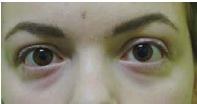
Fig. 5. Mydriasis in left eye more pronounced in dark conditions