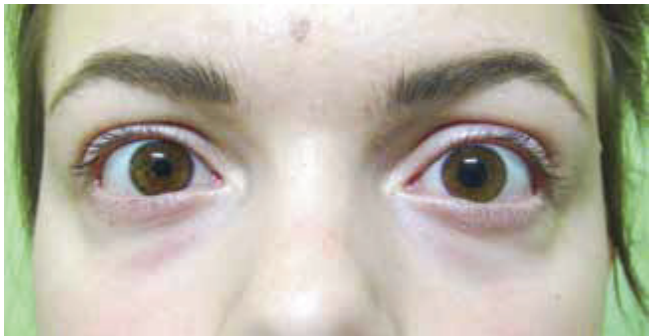
Fig. 6. Negative result of pharmacological test with application of 0.1% Pilocarpine in left eye