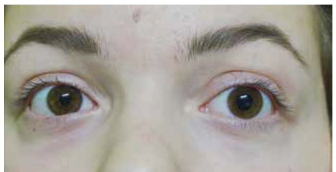
Fig. 4. Anisocoria upon dilation of pupil of left eye in a 16-year-old patient