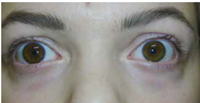
Fig. 7. Positive result of pharmacological test with application of 1.0% Pilocarpine in left eye

pharmacological mydriasis generated by an anti-cholinergic agent (Fig. 7). The objective ocular finding corresponded to neurogenic damage to the parasympathetic part of the left-sided oculomotor nerve, therefore ophthalmoplegia interna comes into consideration. Additional MRI of the brain focusing on the left-sided oculomotor nerve and MRI angiography of the brain capillaries were without evident structural changes. With regard to the negative MRI finding, as well as the fact that spontaneous correction of the width of the left pupil as well as near vision occurred in the patient within less than 24 hours (Fig. 8), we concluded this episode of anisocoria as benign episodic unilateral mydriasis syndrome (BEUM).