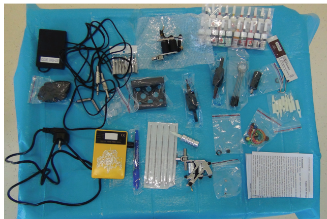
Fig. 1. Tattooing kit and pigments

During a follow-up examination 3 days after the operation, the eyeball was only slightly superficially injected, in