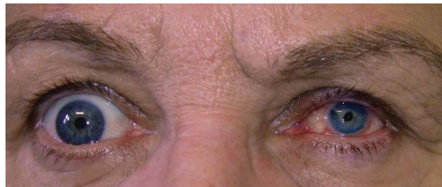
Fig. 4 and 5. Patient 2 before and after KTP procedure