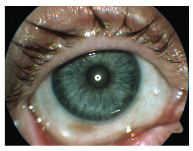
Fig. 3 Finding 3 weeks after commencement of vitamin A substitution per os

patient did not report for any of the originally recommended follow-up examinations.