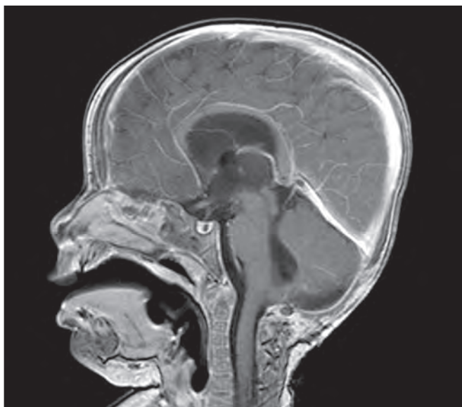
Fig. 3. Postoperative sagittal MRI section.

only congenital but also iatrogenic (e.g. due to lumbar puncture performed with an open needle) or traumatic (e.g. due to a stab or puncture wound), occurring as a consequence of an implantation of skin elements from the surface into underlying tissues. This type of a cyst may occur at any age but much less commonly than the congenital one [6]. At present, CT and MRI scans are both used for the diagnosis of this tumour. CT images the dermoid cyst as a hypodense lesion, not enhancing after a contrast agent administration, unlike abscesses that, if present, are more dense and their capsule is markedly enhanced by a contrast agent. CT bone window is used for bone defects detection. Defects not diagnosed with CT (axial slices may miss it) can be identified with MRI, especially with sagittal plane sections that show the typically oblique stalk that links the cyst with the skin [7]. Dermoid cysts tend to show an increased signal intensity on both T1 and T2-weighted MRI images and a low signal intensity on STIR images [8], although a ruptured cyst may be hypointense on T1-weighted images and hyperintense on T2 [8]. Posterior fossa dermoid cysts may be divided into four types: extradural dermoid cysts with a complete dermal sinus, intradural dermoid cysts without a dermal sinus, intradural dermoid cysts with an incomplete dermal sinus and, as in our case, intradural dermoid cyst with a complete dermal sinus [3]. Intradural dermoid cysts with a complete dermal sinus are difficult