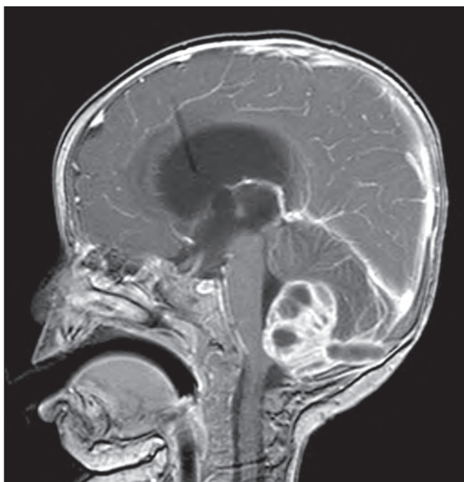
Fig. 1. Sagittal MRI section showing a cerebellar mass lesion communicating subcutaneously through the occipital bone defect.

Dermoid cysts are true ectodermal inclusion lesions lined with epithelium, composed of various amounts of well-differentiated ectodermal and mesodermal elements (endodermal elements are usually not observed, these are more suggestive of a germ cell tumour). Some of these ectodermal inclusions may be hair follicles, sebaceous glands or even sweat glands. The majority of congenital dermoid tumours probably develop during the early stages of development, between the 3 rd to 5 th week of gestation. The presence of another associated congenital anomaly in 50% of patients with dermoid cysts is suggestive of a midline fusion defect. According to the available literature, dermoid cysts are not