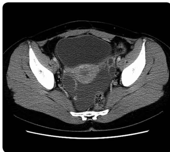
Fig. 2. Large tumor mass in the pelvis prior to initiation of treatment; March 2008.

CK8/18, CD31) were negative. Similarly, immunohistochemistry for C-kit was negative.